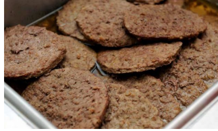
I not 100% sure if these are burgers or some sort of new leather Frisbees.

have said there's no such thing as Grade D beef. I've also heard that it meets only one requirement: "fit for human consumption". Conspiracy? Where was Veronica Mars then?