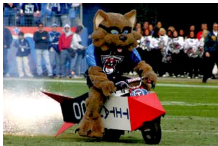
I am a raccoon on a missile with wheels. This makes total sense.

Next time, we'll take a look at who the Bears Ditched during free agency. And maybe, just maybe, we can take another look at that awesome raccoon mascot. Whom T-Rac is now suing for copyright infringement.