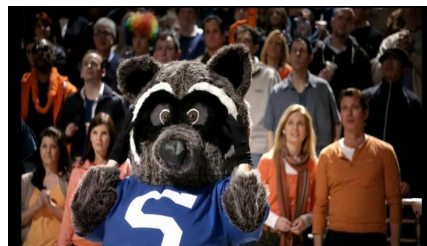
I am an awesome mascot!

OK, now that I have your attention, this has nothing to do with March Madness. It has nothing to do with all the exciting last minute plays leading to surprising upsets by Dayton over Ohio State and Syracuse or Kentucky over the then-undefeated Wichita State. Nor does it have anything to do with the awesome raccoon mascot in this Allstate commercial. But I digress.